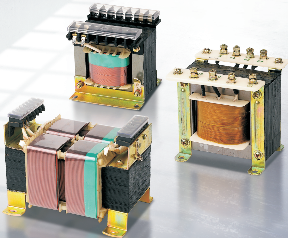
JBK3 series machine control transformer